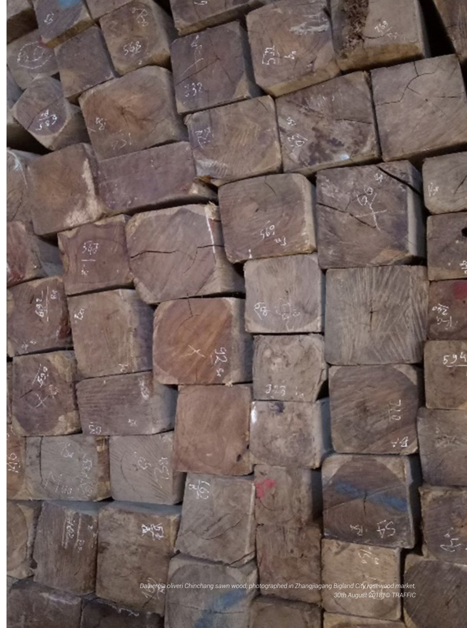
Dalbergia oliveri Chinchang sawn wood, photographed in Zhangjiagang Bigland City rosewood market, 30th August 2018.