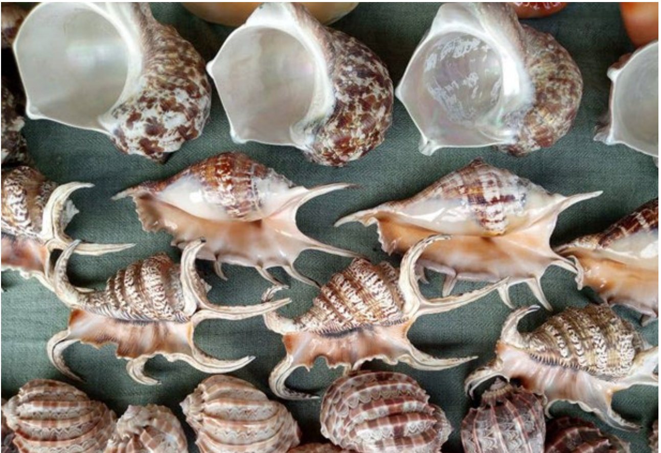
FIGURE 1: Shells photographed from a vendor shop in Dar es Salaam (top row; Great Green Turban, middle row Chiragra Spider Conch, bottom row True Harp)