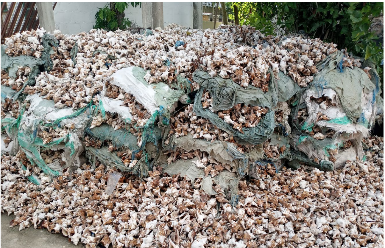
FIGURE 2: Vast quantities of harvested Murex shells outside a curio stall in Bububu, Unguja