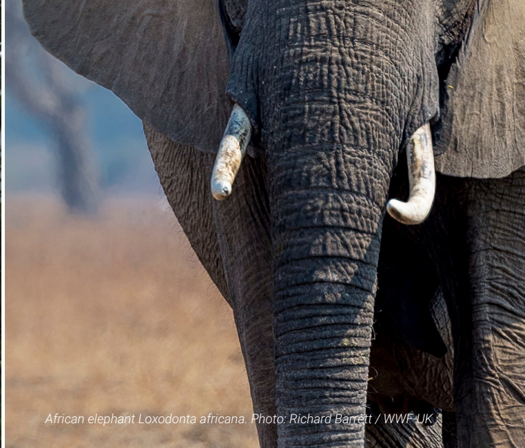
African elephant Loxodonta africana .

“ The AFRICA-TWIX platform as a tool for cooperation between law enforcement agencies in the fight against wildlife crime is an unbelievable investigation accelerator in dismantling transnational IWT networks. Further, the tool has expanded my address book in an extraordinary way. To me AFRICA-TWIX is immeasurably rich.