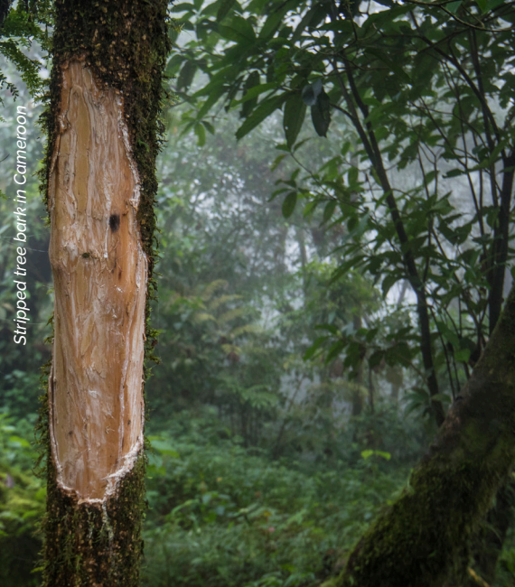
Stripped tree bark in Cameroon