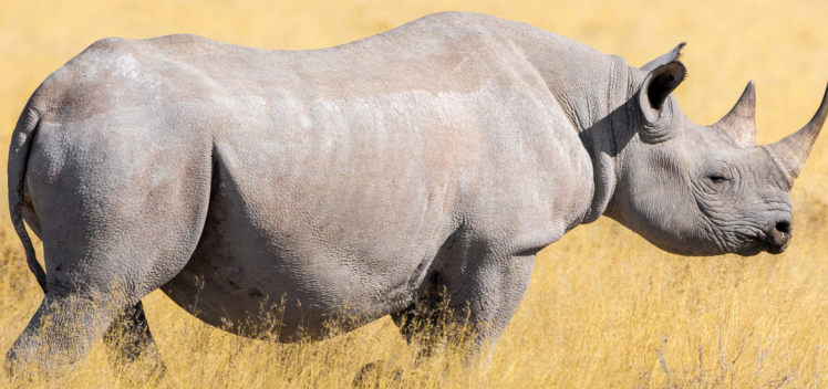
An African rhinoceros.

ensuring sustainable trade and use of natural resources